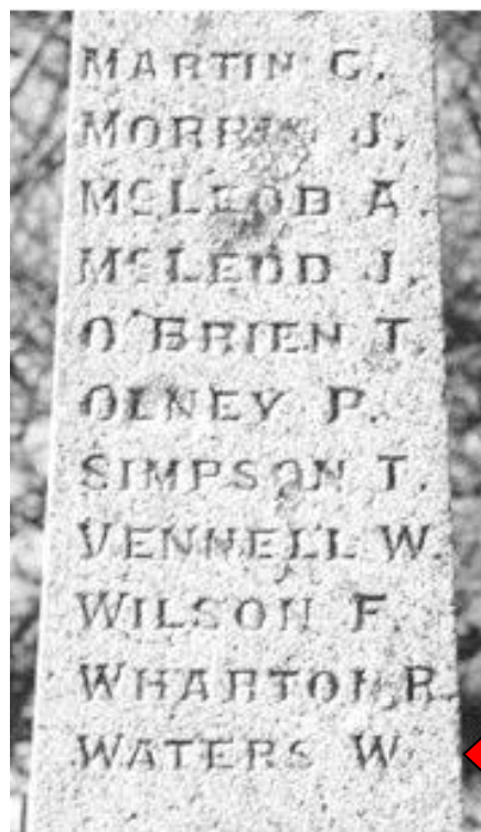
Warburton War Memorial